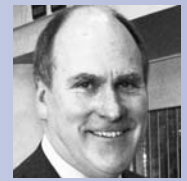
JOSEPH W. CRAFT III